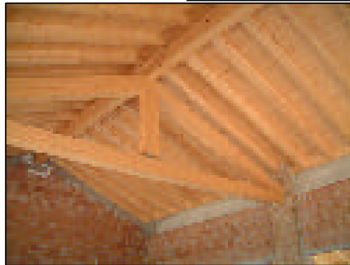
they used only wood from the local area